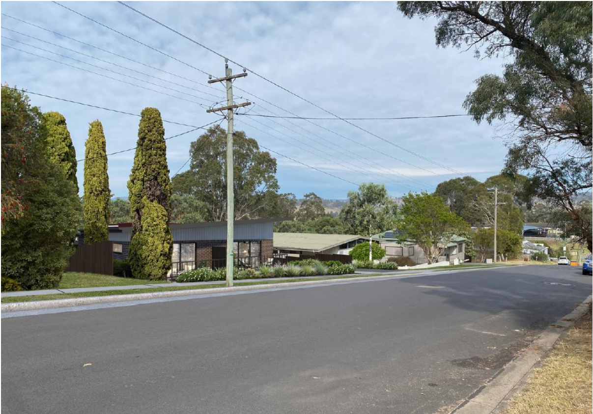
Figure 10 – Looking West at Boarding House 2 at 108 Rawlinson Street.