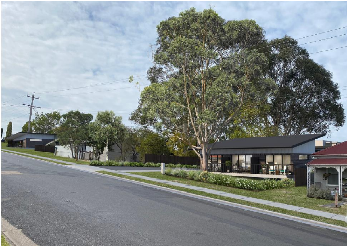
Figure 9 – Looking East at Boarding House 1 at 114 Rawlinson Street.