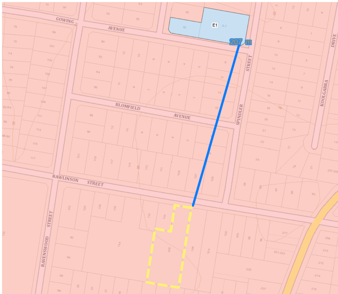
Figure 11- Extract showing BVLEP2013 zone mapping, distance to E1 Local Centre.