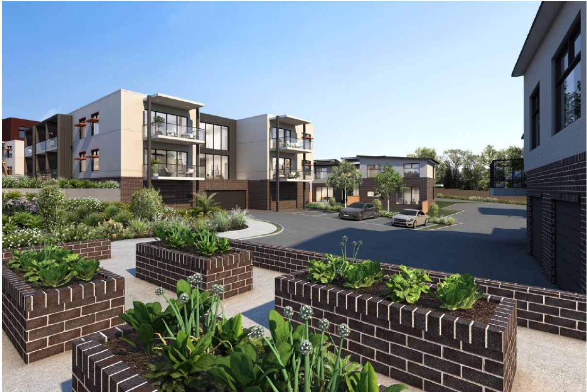
Figure 7 – Looking South at Block A from COS 2.