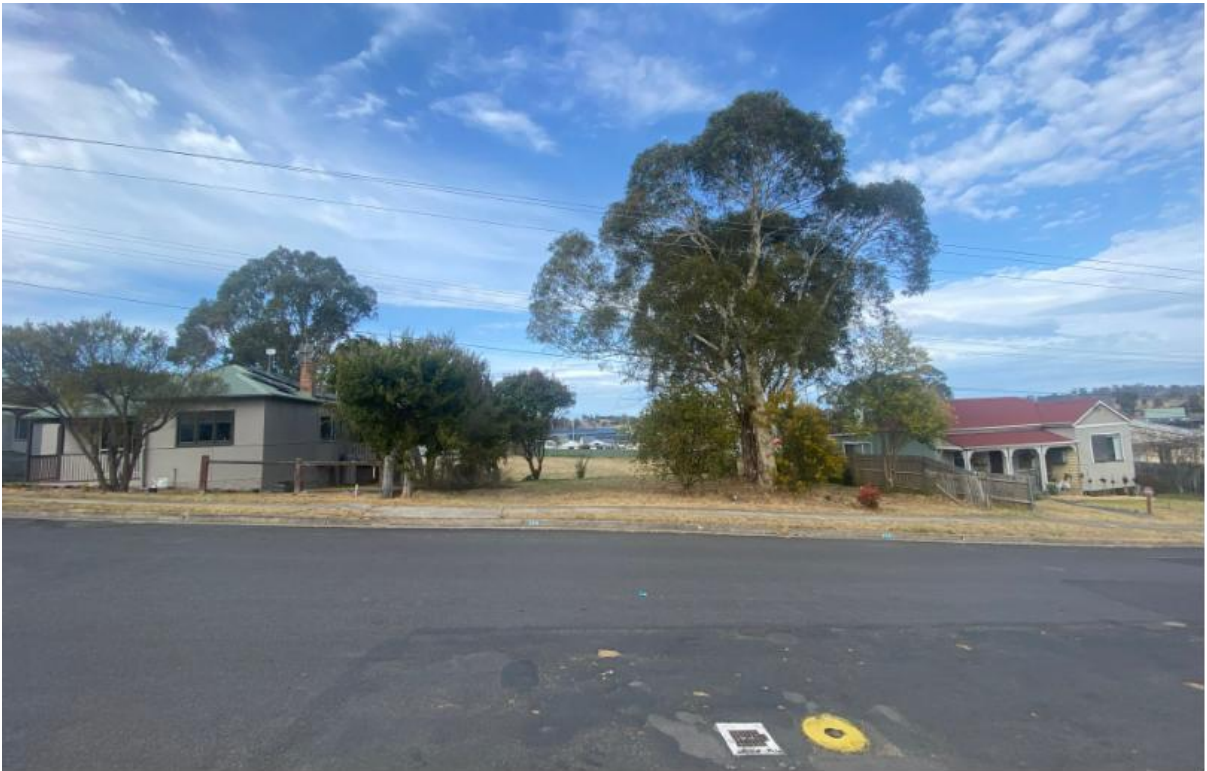
Figure 3 – 114 Rawlinson Street, Bega