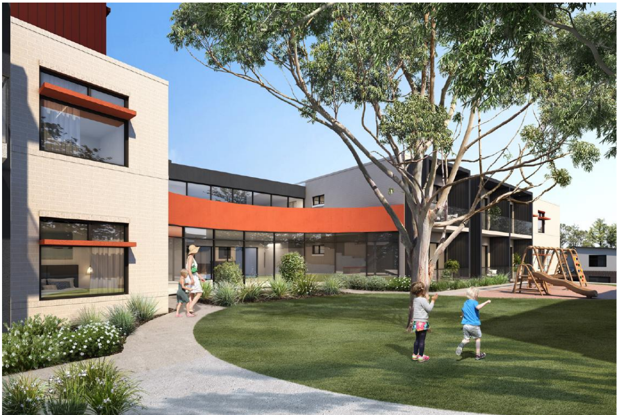
Figure 8 – Looking West at Block A from COS 1.