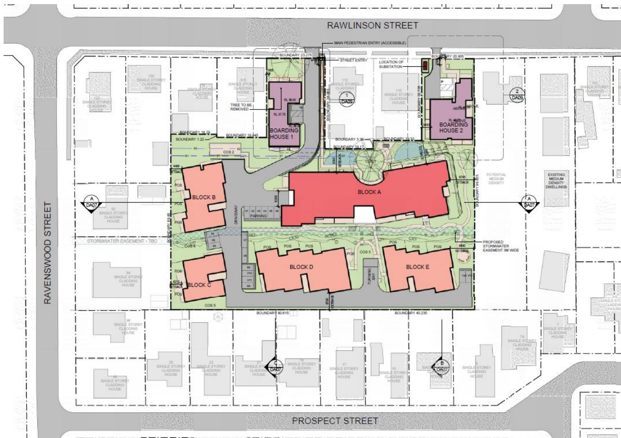
Figure 5- Proposed Site Plan.