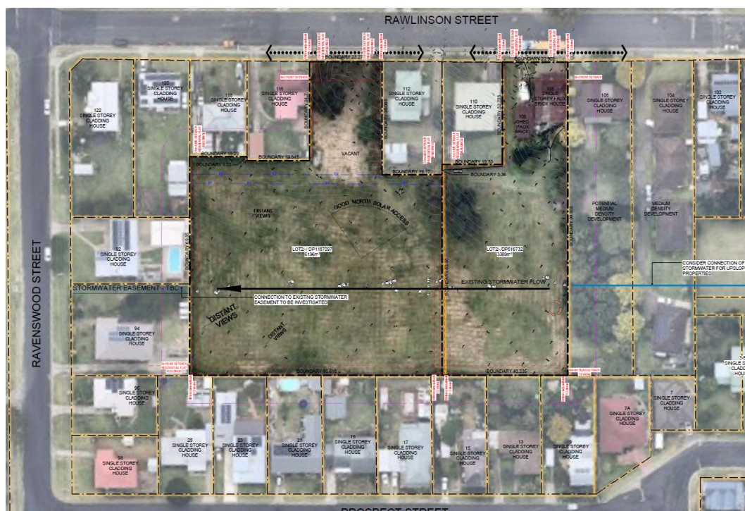
Figure 1 – The Subject Site and Surrounding Properties.