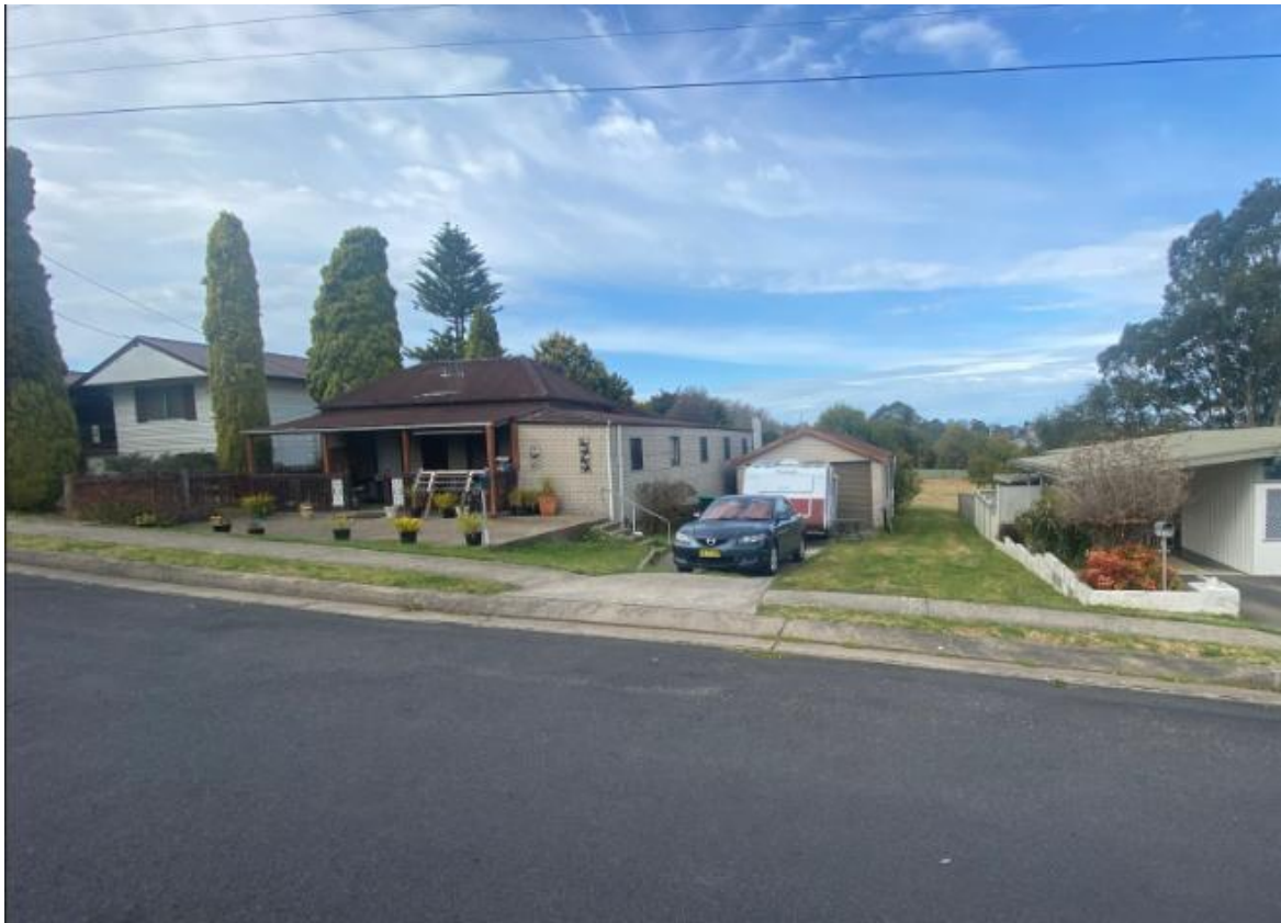
Figure 4 – Proposed for Demolition - 108 Rawlinson Street, Bega