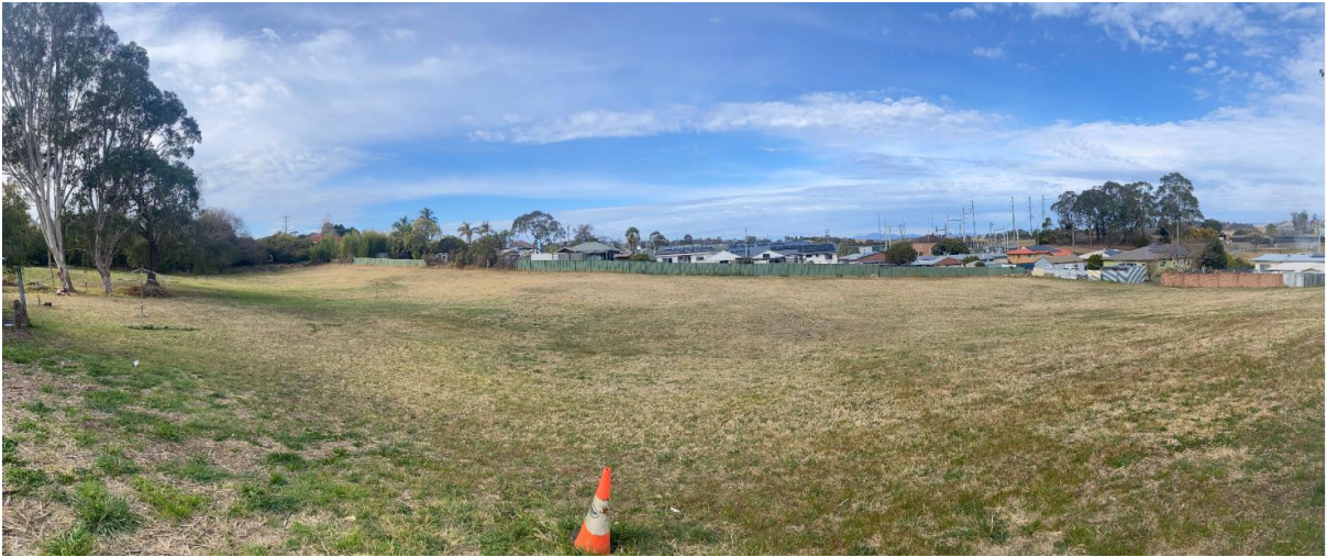
Figure 2- The subject site looking south.